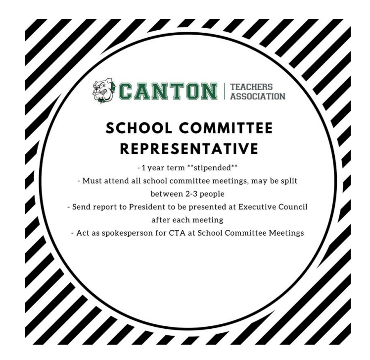
Stipend: $1,200 1 year term ending June 30, 2019