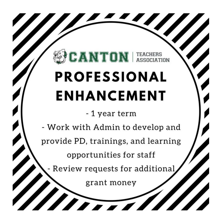
No Stipend - 4 positions open 1 year term ending June 30, 2019