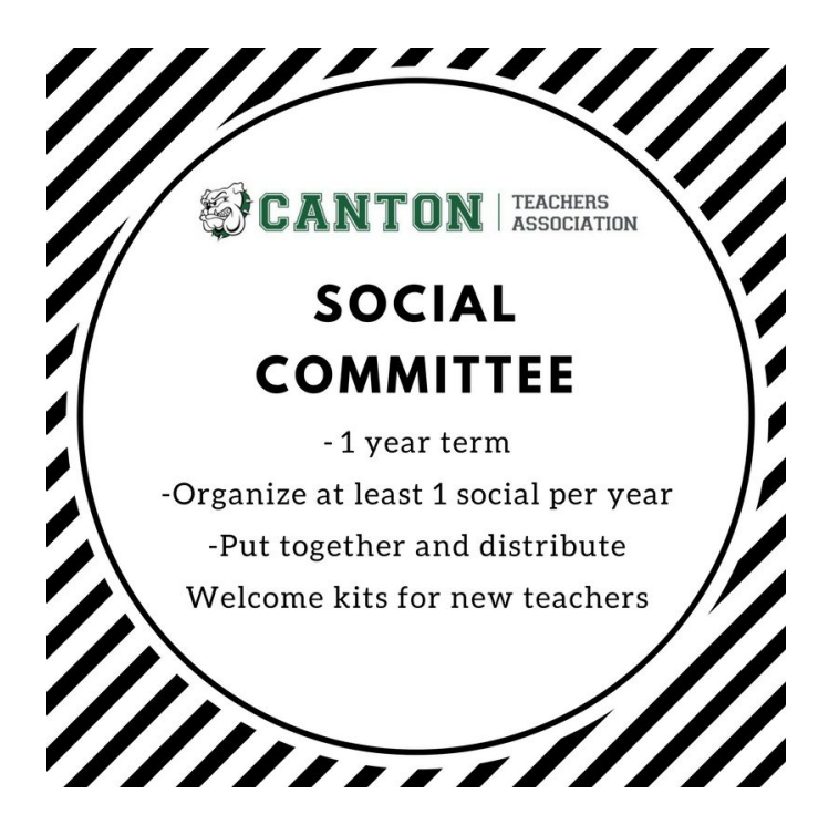
No Stipend - 6 positions open 1 year term ending June 30, 2019